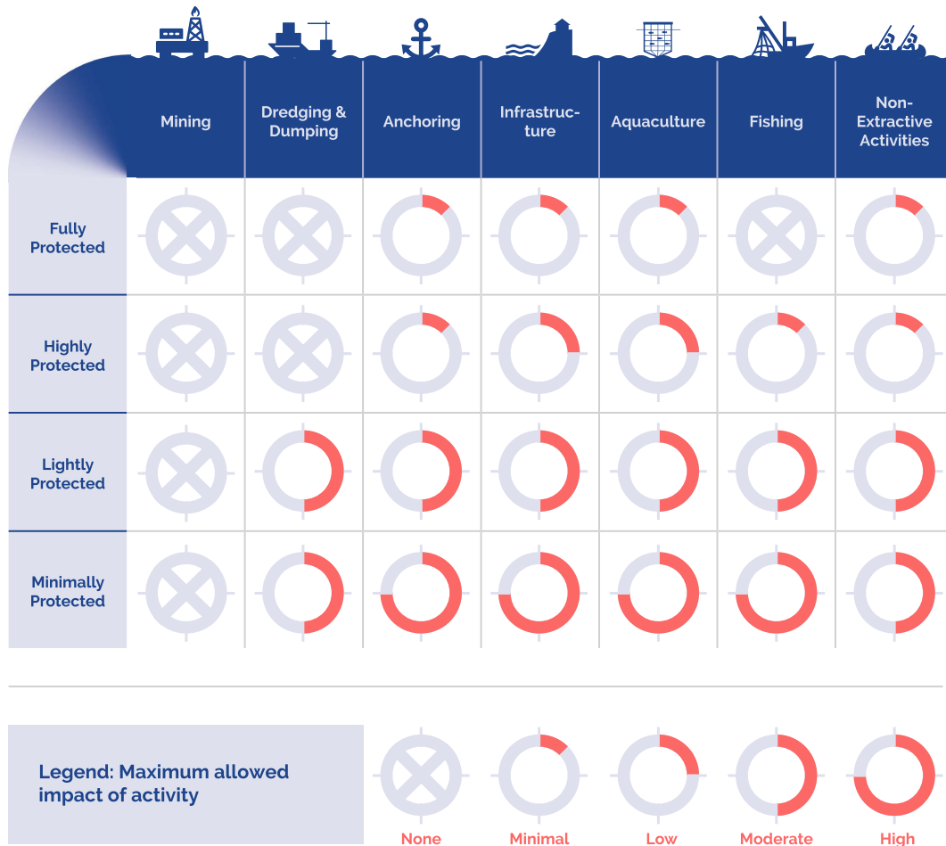
Fig. 1. Level of protection based on maximum allowed impact of seven potential activities in MPAs. An MPA or MPA zone can be categorized into one of four LEVELS of protection: Fully, Highly, Lightly, or Minimally, on the basis of seven types of activities and their impacts (a decision tree approach is available in fig. S2). Dials indicate the scale of impact that may be occurring at a given protection level: none, minimal, low, moderate, or high/large. If impacts are high/large, the

duration, and frequency relative to biodiversity conservation goals and is described as “none,” “low,” “moderate,” “high/large,” or “incompatible with biodiversity conservation” (Fig. 1 and fig. S2). Using this impact scale, a LEVEL of protection can be assigned for any given MPA or zone regardless of location, species, or circumstances. Impacts of certain activities may scale differently considering specific features of an MPA or zone, such as size; for example, distribution of an activity across areas of different sizes may render it high impact in a smaller MPA but moderate impact in a larger MPA. Incompatible activities include industrial extraction such as industrial fishing (for example, vessels > 12 m using towed or dragged gears), oil and gas exploration, mining, or other extremely impactful activities such as fishing with dynamite or poison (supplementary materials, LEVELS Expanded Guidance,